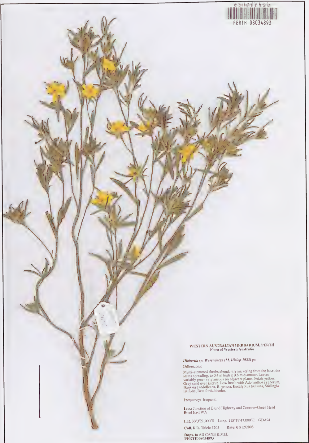
Figure 1. Holotype of Hibbertia leucocrossa . Scale bar = 5 cm.